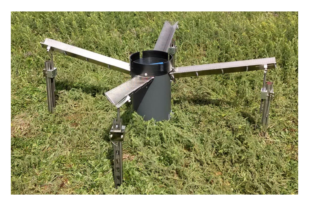
Figure 2: Image of a modified Met One tipping bucket sensor to collect throughfall in the field.

Figure 1: Image of a non-heated Met One tipping bucket sensor. The internal tipping mechanism can be seen on the left and the complete unit with shroud and funnel shown on the right.