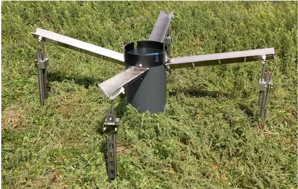
Figure 2. Image of a modified Met One tipping bucket sensor to collect throughfall in the field.