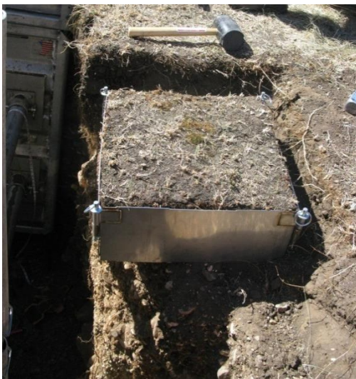
Figure 4. Intact block of soil during (left panel) and after (right panel) collection at D09 Woodworth.

Up to 6 intact blocks of soil (40 x 40 cm horizontally x 16 cm tall) are collected from each soil pit to calibrate NEON's soil water content sensor to the local soil type and to measure the rate of CO 2 diffusivity through the soil. The soil block is collected within a stainless steel box with a removable top and bottom plate. The soil block is collected by exposing a ~70 x 70 cm area of soil at the upper depth of the intended sample, placing the box (without top or bottom plate) on the exposed soil, and excavating around the edge of the sample while lowering the sides of the box into place. Once the top of the box walls are level with the top of the sample, the bottom plate is inserted beneath the sample, the sample is removed, and sealed up ( Figure 4 ).