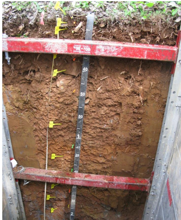
Figure 3. The soil pit at the Smithsonian Conservation Biological Institute, VA.

In Figure 3 , the small pins identify the soil horizon boundaries, while yellow markers display the soil horizon name. Additionally, two scales with different granularities are shown here (meter/centimeter units). Subsequent photos were taken to capture additional details.