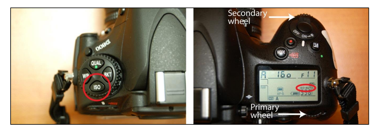
Figure 18. Nikon D800/D810: Configuring ISO settings for downward- and upward-facing photos.