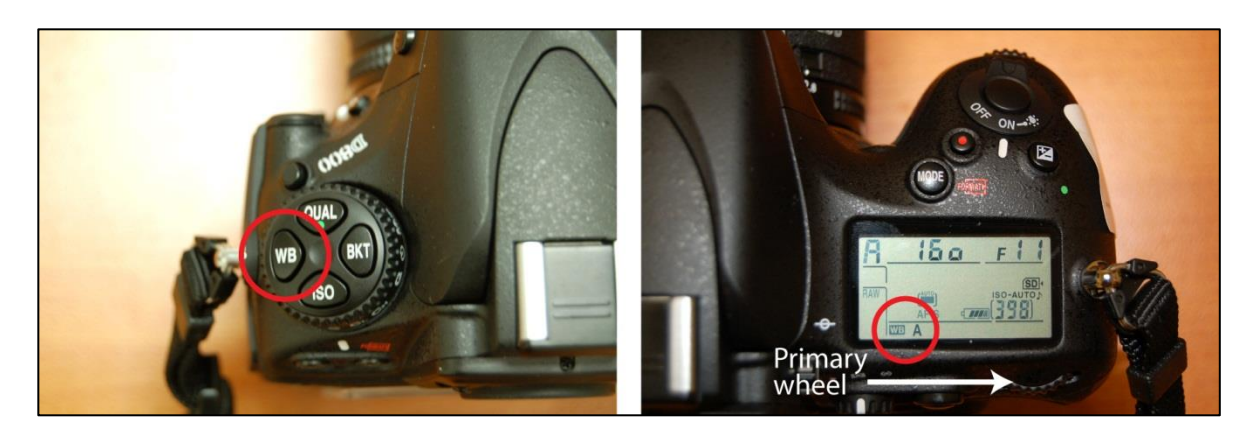
Figure 3. Nikon D800/D810: Adjusting white balance settings.

Desired setting = Auto. To adjust, press the "WB" button on the left control knob (below left), and rotate the primary wheel until "WB A" is displayed in the top LCD (below right).