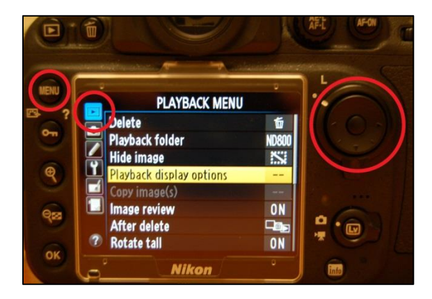
Figure 5. Nikon D800/D810: Playback Menu display options.

1. Press the "Menu" button, then use the "Multi-selector" button (circled below-right) to navigate to "Playback Menu → Playback display options".