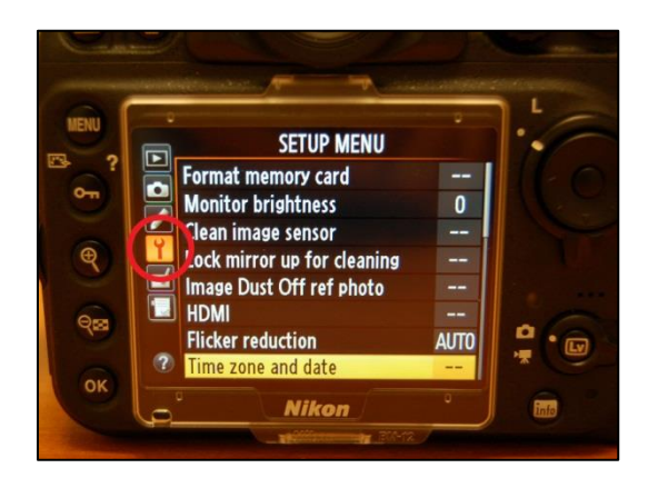
Figure 13. Nikon D800/D810: Setup Menu options for timezone and date.