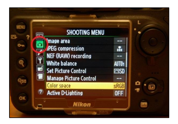
Figure 9. Nikon D800/D810: Shooting Menu color space options.

Desired setting = sRGB. To adjust, press "Menu", and select "Shooting Menu \rightarrow Color space". Select "sRGB" and press the "OK" button.