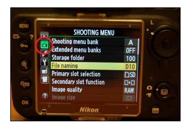
Figure 8. Nikon D800/D810: Shooting Menu file naming options.

Desired setting = DXX, where XX = the unique NEON Domain number. To adjust, press the "Menu" button, and select "Shooting Menu \rightarrow File naming". Enter the appropriate alpha-numeric characters. When finished, "DSC" should no longer be displayed, and your custom characters should be.