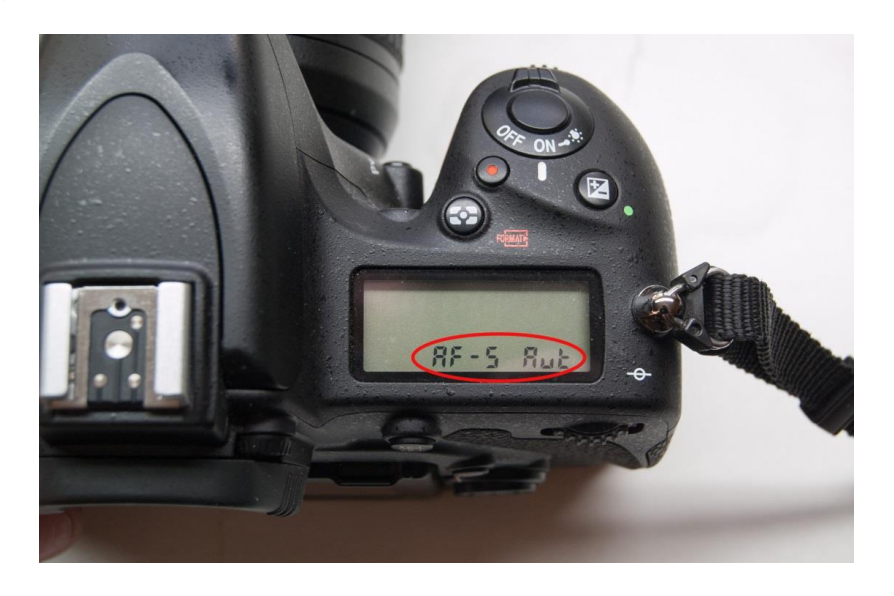
Figure 26. Nikon D750: Top LCD display when camera is configured for single-servo auto-focus auto-mode, where the camera software automatically determines which of the 51 available focus points are used to focus the lens on the subject.