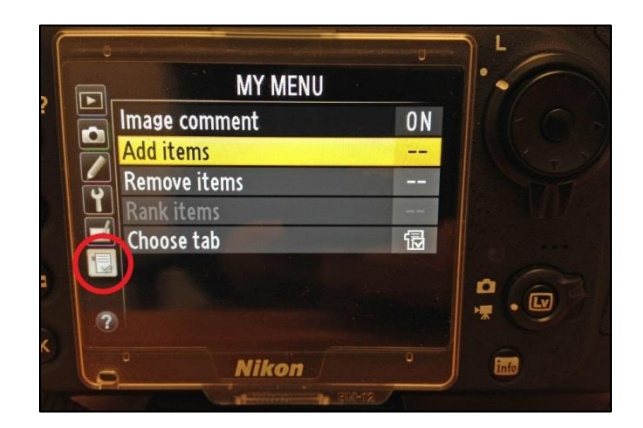
Figure 14. Nikon D800/D810: My Menu customization.