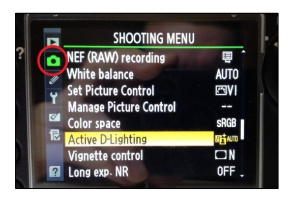
Figure 10. Nikon D800/D810: Shooting Menu Active D-lighting options.

Desired setting = AUTO. To adjust, press "Menu", and select "Shooting Menu \rightarrow Active D-Lighting". Select "Auto" and press the "OK" button.