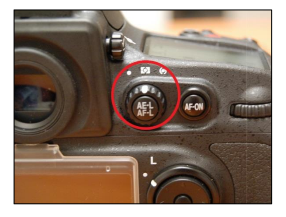
Figure 4. Nikon D800/D810: Setting the metering mode.

Desired setting = Matrix Metering. To adjust, rotate the outer ring of the "AE-L/AF-L" button to the center position (see below).