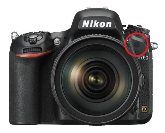
Figure 21. Nikon D750: Front-side infrared sensor (red circle) for wireless shutter release.