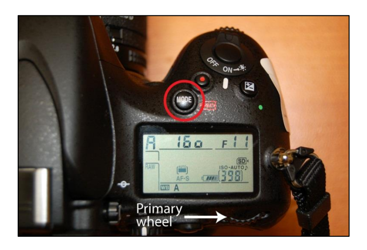
Figure 15. Nikon D800/D810: Setting the desired Exposure mode.

To adjust, press the Mode button, and rotate the primary wheel until the top LCD shows the desired mode (A or M, depending on camera orientation that will be used).