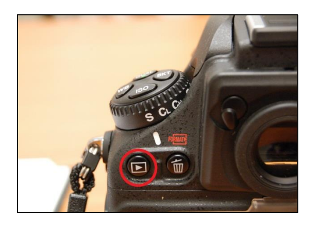
Figure 6. Nikon D800/D810: Location of the "Play" button.

5. Use the L and R arrow keys on the Multi-Selector to select the desired image.