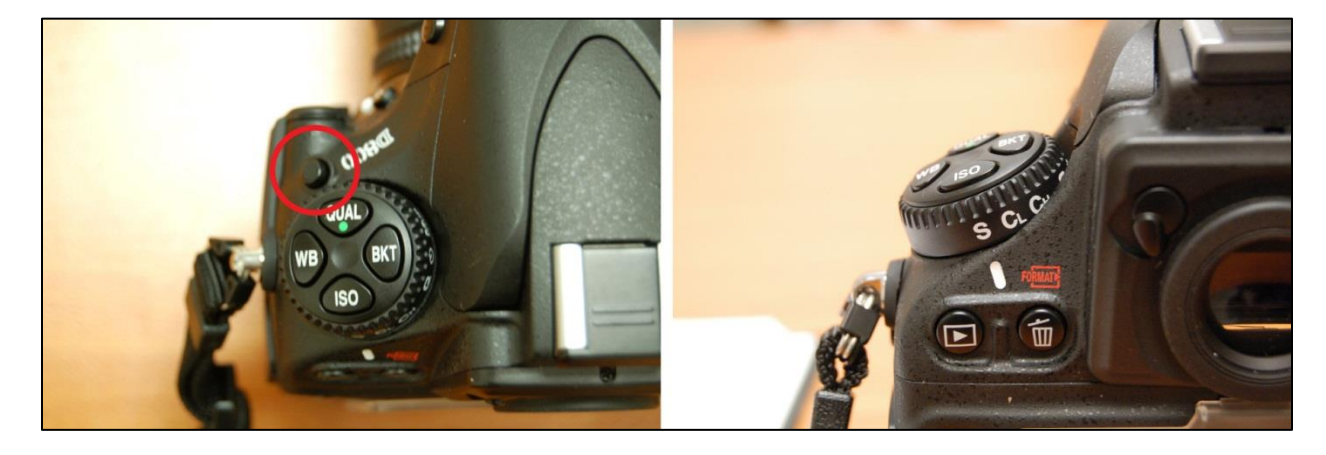
Figure 1. Nikon D800/D810: Setting the shutter-release mode.