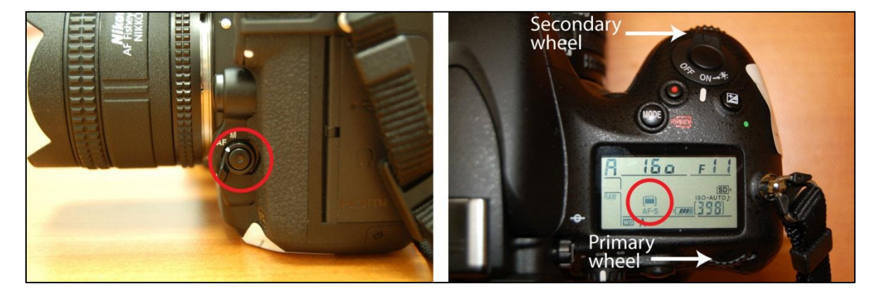
Figure 16. Nikon D800/D810: Configuring focus mode to auto-focus for downward-facing photos.