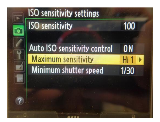
Figure 12. Nikon D800/D810: Shooting Menu ISO sensitivity settings menu.