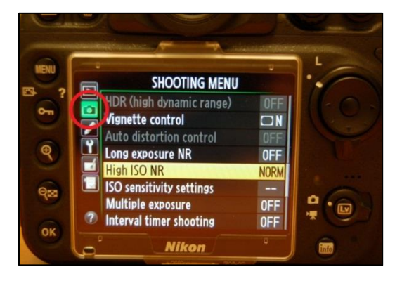
Figure 11. Nikon D800/D810: Shooting Menu high ISO noise reduction options.

Desired setting = Normal. To adjust, press "Menu" and select "Shooting Menu \rightarrow High ISO NR". Select "Normal" and press the "OK" button.