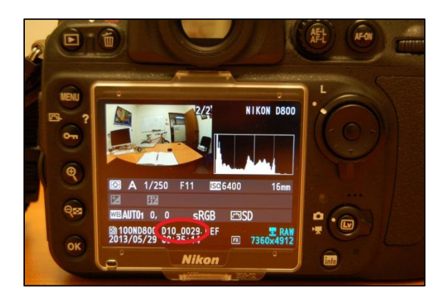
Figure 7. Nikon D800/D810: Locating the file name in the "overview" histogram view during file playback.

6. Press the Up and Down arrow keys on the Multi-Selector to bring up the "Overview" histogram information (below). The red circle indicates the file name.