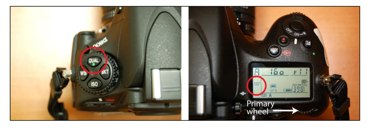
Figure 2. Nikon D800/D810: Setting image quality to RAW.

Desired setting = RAW. To adjust, press the "QUAL" button on the left control knob (below left), and rotate the primary wheel until "RAW" is displayed in the top LCD (below right).