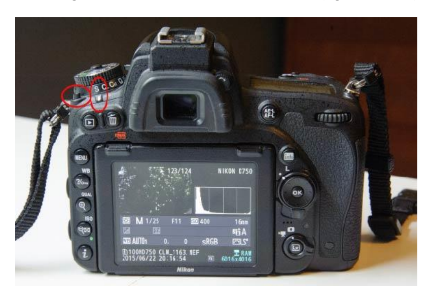
Figure 20. Nikon D750: Setting the shutter-release mode.