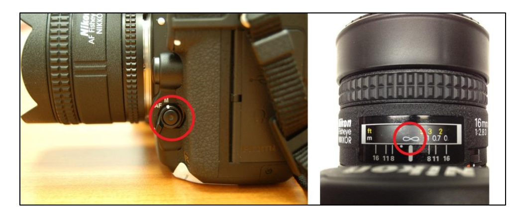
Figure 27. Nikon D750: Focus mode switch, with auto-focus selector button in middle of switch.

Desired setting = Manual. To adjust, set the focus switch to "M" (below left), and rotate the focus ring on the lens to " \infty " (below right).