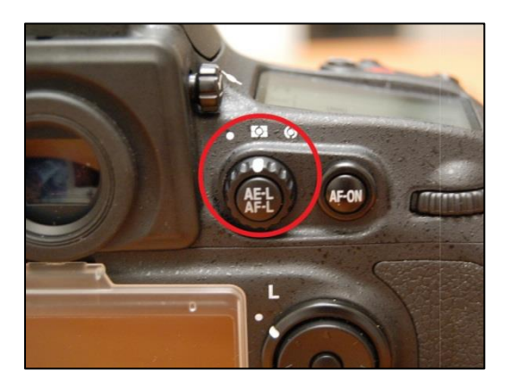
Figure 4. Nikon D800/D810: Setting the metering mode.

Desired setting = Matrix Metering. To adjust, rotate the outer ring of the "AE-L/AF-L" button to the center position (see below).