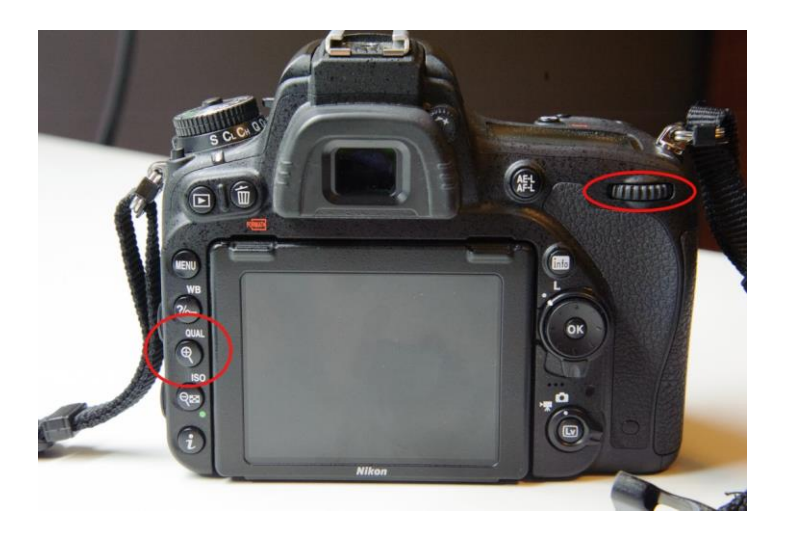
Figure 22. Nikon D750: Configuring image quality settings.