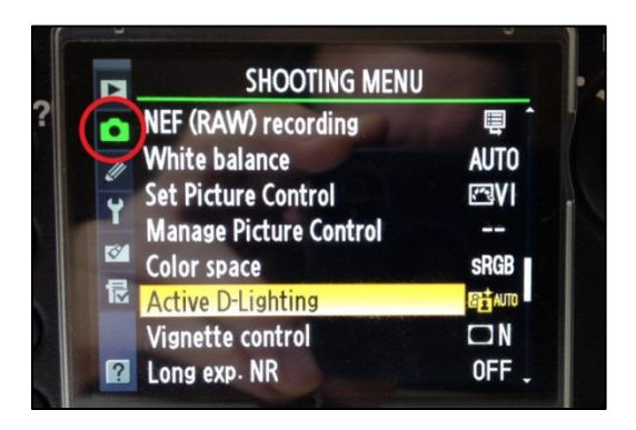
Figure 10. Nikon D800/D810: Shooting Menu Active D-lighting options.

Desired setting = AUTO. To adjust, press "Menu", and select "Shooting Menu \rightarrow Active D-Lighting". Select "Auto" and press the "OK" button.