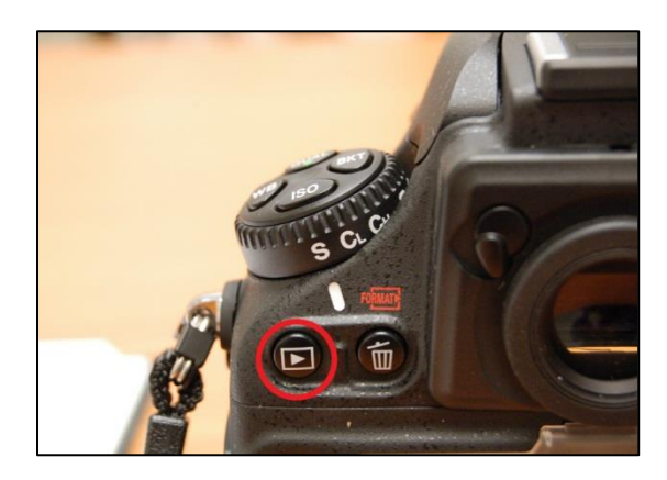
Figure 6. Nikon D800/D810: Location of the "Play" button.

5. Use the L and R arrow keys on the Multi-Selector to select the desired image.