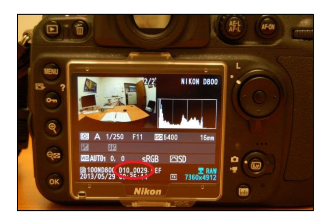
Figure 7. Nikon D800/D810: Locating the file name in the "overview" histogram view during file playback.

6. Press the Up and Down arrow keys on the Multi-Selector to bring up the "Overview" histogram information (below). The red circle indicates the file name.