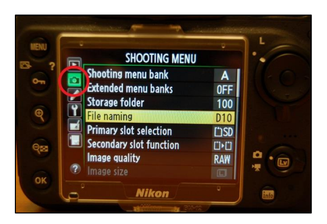
Figure 8. Nikon D800/D810: Shooting Menufile naming options.

Desired setting = DXX, where XX = the unique NEON Domain number. To adjust, press the "Menu" button, and select "Shooting Menu → File naming". Enter the appropriate alpha-numeric characters. When finished, "DSC" should no longer be displayed, and your custom characters should be.