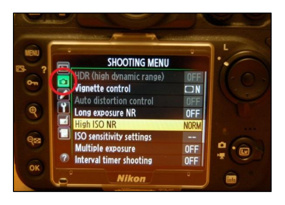
Figure 11. Nikon D800/D810: Shooting Menu high ISO noise reduction options.