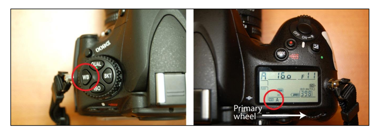
Figure 3. Nikon D800/D810: Adjusting white balance settings.

Desired setting = Auto. To adjust, press the "WB" button on the left control knob (below left), and rotate the primary wheel until "WB A" is displayed in the top LCD (below right).