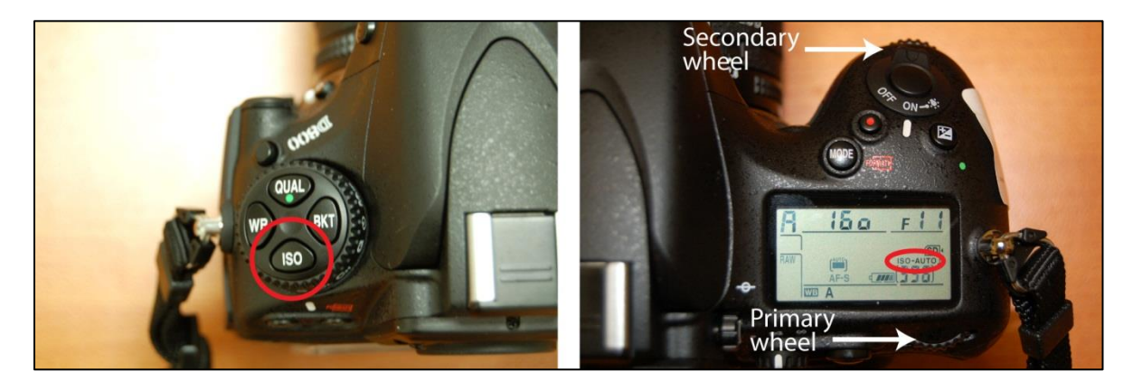
Figure 18. Nikon D800/D810: Configuring ISO settings for downward- and upward-facing photos.