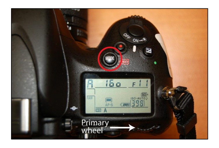
Figure 15. Nikon D800/D810: Setting the desired Exposure mode.