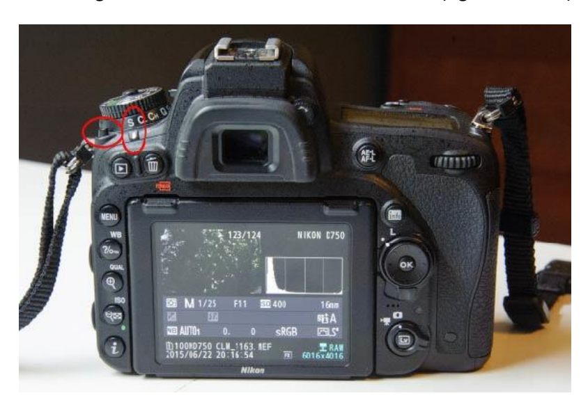
Figure 20. Nikon D750: Setting the shutter-release mode.

Self timer mode will allow up to 20 seconds to elapse between when the shutter-release button is pressed, and when the camera trips the shutter. This mode may be useful when using the monopod in some circumstances. To adjust: