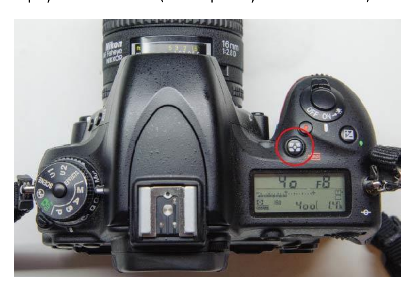
Figure 25. Nikon D750: Configuring the metering mode.

Desired setting = Matrix Metering. To adjust, press metering button (circled below) until matrix metering symbol is displayed on LCD screen (same square symbol as on button).