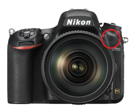
Figure 21. Nikon D750: Front-side infrared sensor (red circle) for wireless shutter release.