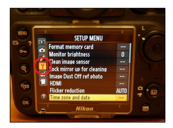
Figure 13. Nikon D800/D810: Setup Menu options for timezone and date.