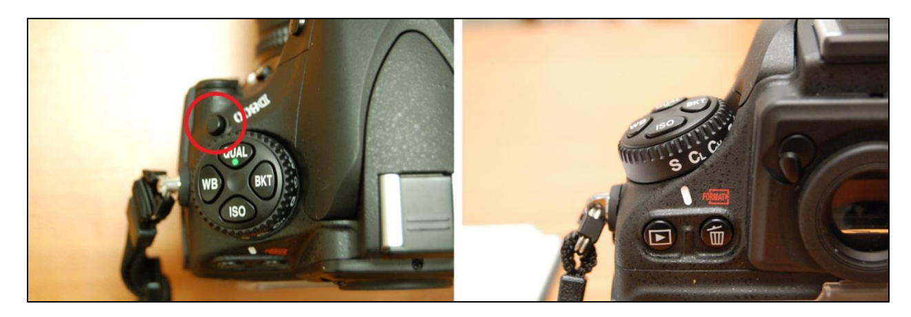
Figure 1. Nikon D800/D810: Setting the shutter-release mode.