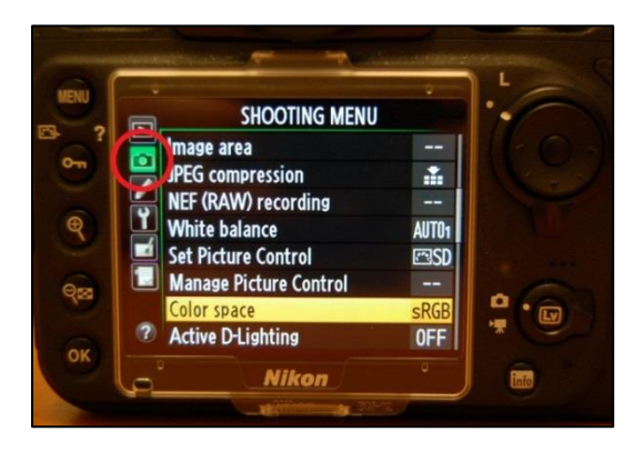
Figure 9. Nikon D800/D810: Shooting Menu color space options.

Title: TOS Standard Operating Procedure (SOP): DSLR Configuration Date: 03/10/2022 NEON Doc. #: NEON.DOC.001718 Author: Courtney Meier Revision: D