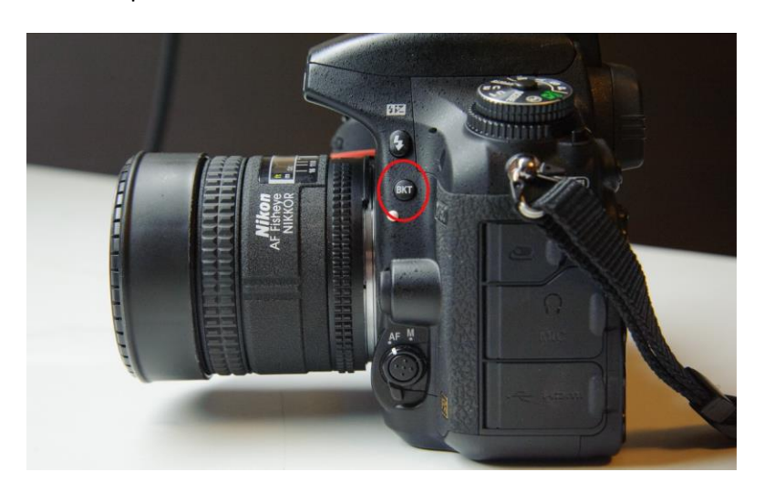
Figure 24. Nikon D750: Toggling bracketing on and off.

Desired setting = OFF. To adjust, press and hold the 'BKT' button (circled below). The rear LCD will show "OF" toward the top-center. Rotate the primary wheel until 'number of shots' = 0; the letters 'BKT' should be absent from the top LCD.