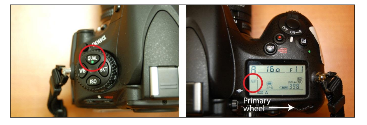
Figure 2. Nikon D800/D810: Setting image quality to RAW.

Desired setting = RAW. To adjust, press the "QUAL" button on the left control knob (below left), and rotate the primary wheel until "RAW" is displayed in the top LCD (below right).