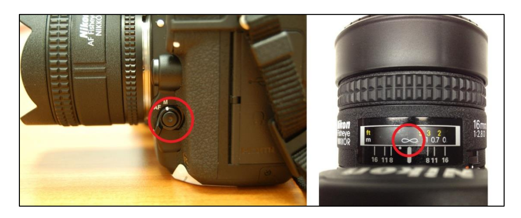
Figure 27. Nikon D750: Focus mode switch, with auto-focus selector button in middle of switch.

Desired setting = Manual. To adjust, set the focus switch to "M" (below left), and rotate the focus ring on the lens to " \sim " (below right).