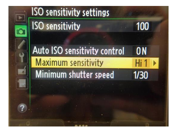
Figure 12. Nikon D800/D810: Shooting Menu ISO sensitivity settings menu.