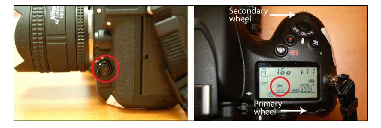
Figure 16. Nikon D800/D810: Configuring focus mode to auto-focus for downward-facing photos.