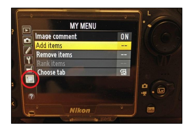
Figure 14. Nikon D800/D810: My Menu customization.