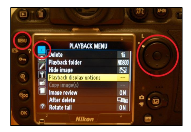
Figure 5. Nikon D800/D810: Playback Menu display options.

1. Press the "Menu" button, then use the "Multi-selector" button (circled below-right) to navigate to "Playback Menu → Playback display options".