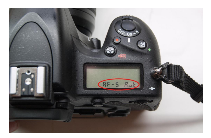
Figure 26. Nikon D750: Top LCD display when camera is configured for single-servo auto-focus auto-mode, where the camera software automatically determines which of the 51 available focus points are used to focus the lens on the subject.