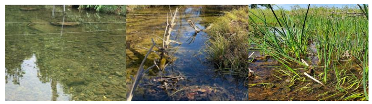
Figure 7. Example of absent/present/heavy aquatic plants.

Assess the presence of aquatic plants along the portion of reach visited during field work. An aquatic plant is any plant that is rooted within the wetted width of the stream.