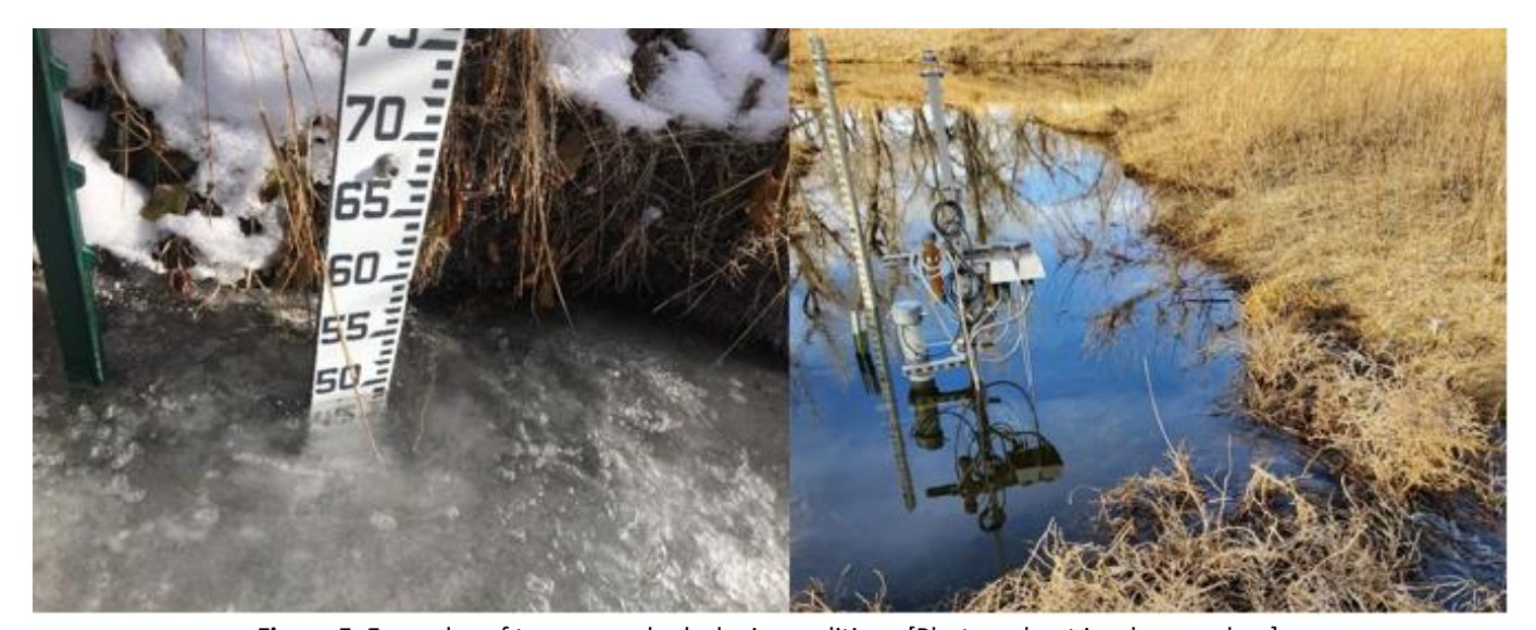
Figure 5. Examples of temporary hydrologic conditions [Photos: sheet ice, beaver dam].