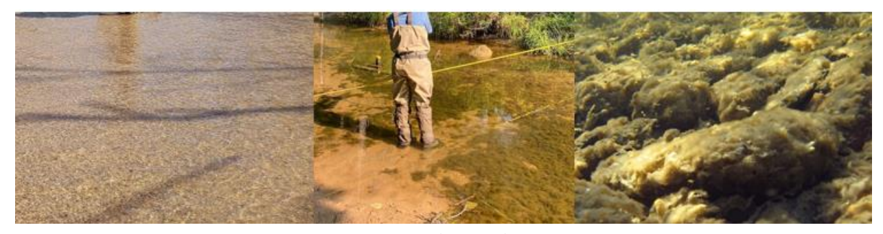
Figure 6. Example of absent/present/heavy benthic algae.

Algal growth on the substrate of the stream or river is considered benthic algae ( Figure 6 ). A common form of this seen at NEON sites is didymos.