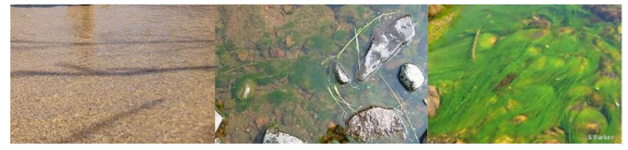
Figure 8. Examples of absent/present/heavy filamentous algae.

Assess the quantity of macro and filamentous algae at site within the wetted channel.