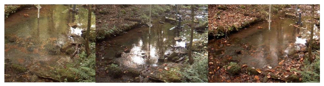
Figure 9. Example of Absent/Present/Heavy leaf litter at D07 WALK.

Assess the quantity of leaf litter within the channel. Leaf litter can include deciduous leaves as well as coniferous needles. Both can impact streambed roughness, reaeration, invert populations, and changes in stage.