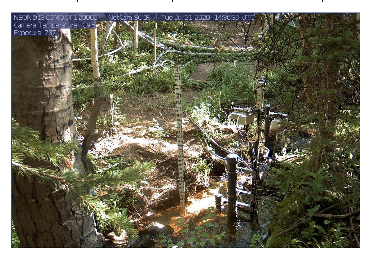
Figure 1. Example of a staff gauge installation.