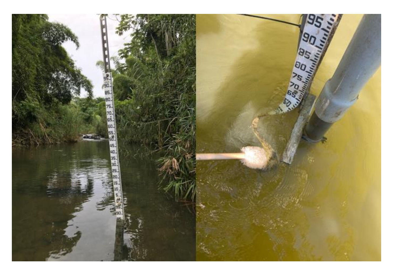
Figure 2. Examples of gauges needing repair.

Title: AOS Protocol and Procedure: GAG – Aquatic Staff Gauge Measurement Readings and Field Metadata Date: 01/10/2023 NEON Doc. #: NEON.DOC.005277 Author: B. Nance Revision: B