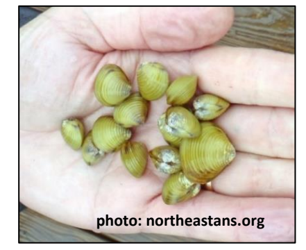
Figure 6 Asian clams are common in streams in the eastern US

"Didymo", rock snot (Didymosphenia geminata) – Although native to many cold-water streams in North America, the range of Didymo has been expanding, and it was listed as a nuisance species in 2005. Large mats of the diatom