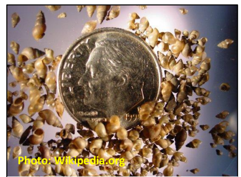
Figure 4 New Zealand mudsnails spread easily due to their small size

Chytridiomycosis, or chytrid disease, has caused a massive decline in amphibian diversity since 1998. Chytrids are microscopic and transported in water, but can be destroyed using bleach and hot water.