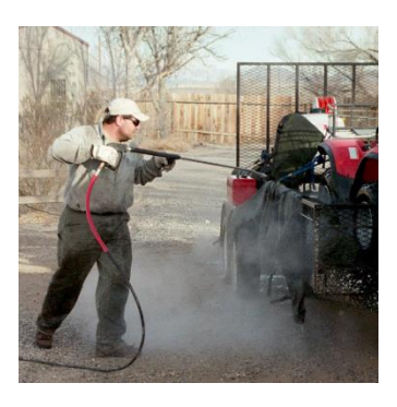
Figure 2 Power washing can be an effective way to clean equipment. Inspect after cleaning.

Field vehicles, whether used for operation and maintenance of terrestrial or aquatic infrastructure, need to be inspected and decontaminated in accordance with Table 4 above. The following guidance is adapted from the Plant Dispersal Information System (ER[25]). One option to minimize the amount of decontamination needed is to assign individual rental trucks to specific sites during the field season.