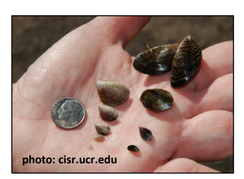
Figure 5 Quagga mussels have spread into Western U.S. waters; and are resistant to desiccation

1987. They are small (4-6 mm) outside of their native range and thrive in disturbed, silted streams (Figure 4). Because of their small size, they are easily transported in waders and nets. Bleach treatment is not effective; in mudsnail-infested waters use stronger ammonium compounds.