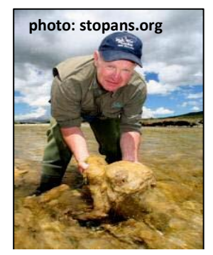
Figure 8 Didymo is a stalked diatom that forms large mats in streams

filter water and alter stream habitat (Figure 7). Didymo is microscopic and can be spread in a small amount of water, so bleach cleaning of equipment and waders is important in restricting its spread. It occurs at West St. Louis Creek (D13) (see JIRA ticket NEON-3870). Other stalked diatoms such as Cymbella spp. may also function as a filter in some streams such as Blacktail Deer Creek (D12) (see JIRA ticket NEON-3494). In the absence of information, treat similar growth of other stalked diatoms species with caution.