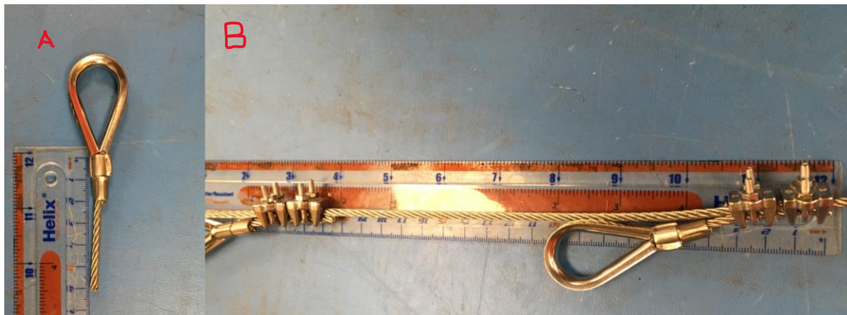
Figure 2. (A) image of a single side connector. (B) Two side connectors attached to a main line.

The length of the side connector measured from the inside rounded curve of the thimble to the bare end of the cable should be 10.2 cm. This also corresponds to 6.0 cm from the edge of the thimble to the end of the cable ( Error! Reference source not found.A ). A consistent side connector dimension ensures standard relative logger positioning across an assembly.