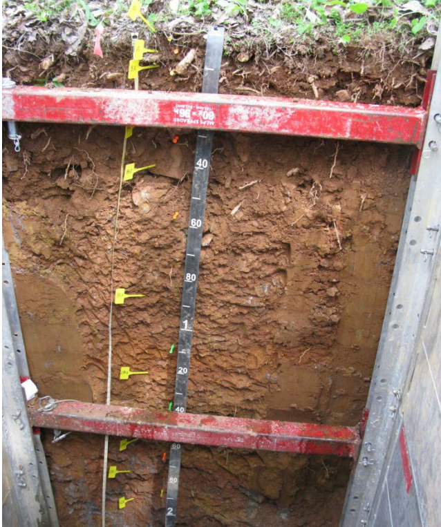
Figure 3. The soil pit at the Smithsonian Conservation Biological Institute, VA

At each site, photos of the entire profile are taken (or large sections of the profile if it is not possible to fit it all into a single photo). In addition, close-up photos of each horizon are taken.