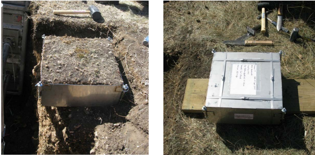
Figure 4. Intact block of soil during (left panel) and after (right panel) collection at D09 Woodworth

Ideally one block of soil is collected from each soil horizon. For horizons less than 16 cm thick (i.e., the required height of the sample), the soil block should be vertically centered on the soil horizon unless that would raise the top of the sample above the soil surface. Note that the uppermost soil block collected from each soil pit often contains several soil horizons since the horizons near the soil surface tend to be thin.