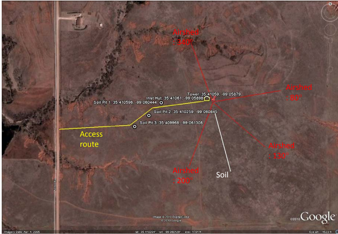
Figure 2. NEON site layout at Klemme from the FIU Site Characterization Report showing soil array and suggested location of the FIU soil pit