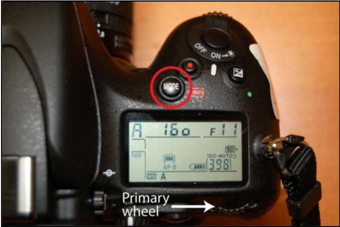
Figure 15. Nikon D800/D810: Setting the desired Exposure mode.

To adjust, press the Mode button, and rotate the primary wheel until the top LCD shows the desired mode (A or M, depending on camera orientation that will be used).