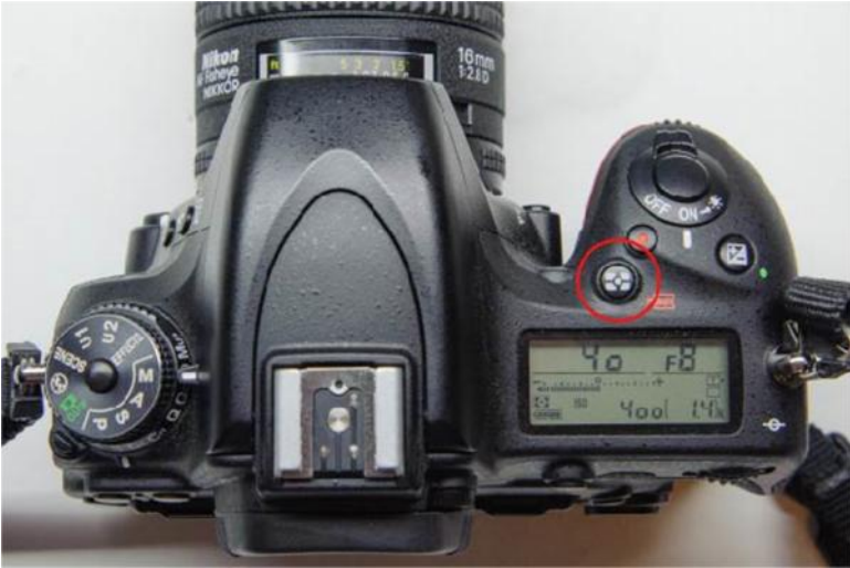
Figure 24. Nikon D750: Configuring the metering mode.

Desired setting = Matrix Metering. To adjust, press metering button (circled below) until matrix metering symbol is displayed on LCD screen (same square symbol as on button).