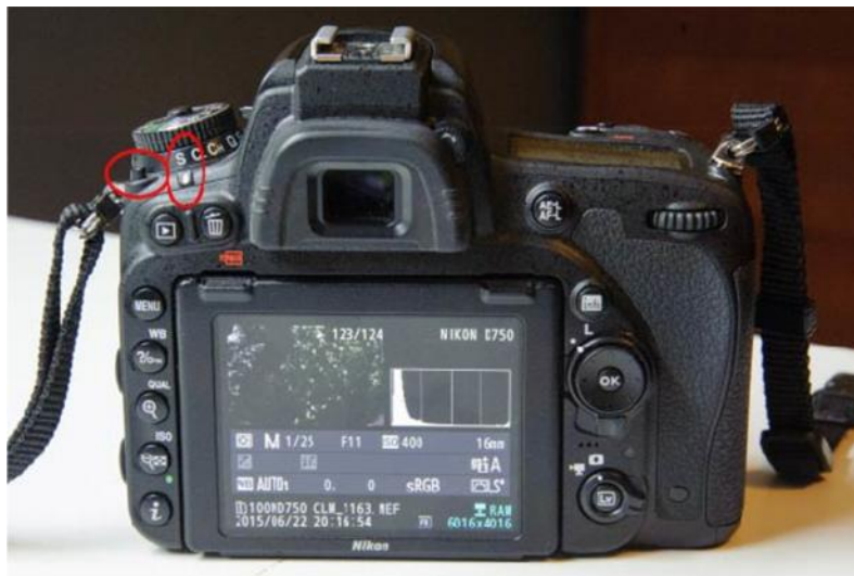
Figure 20. Nikon D750: Setting the shutter-release mode.

Desired setting = S (single shot). To adjust, press the button near the left control knob (left red circle), and rotate the outer-ring of the control knob until “S” is selected (right red circle).