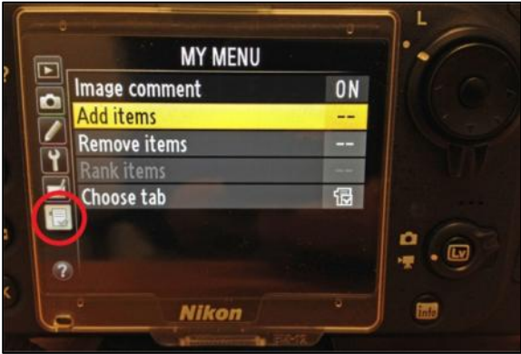
Figure 14. Nikon D800/D810: My Menu customization.