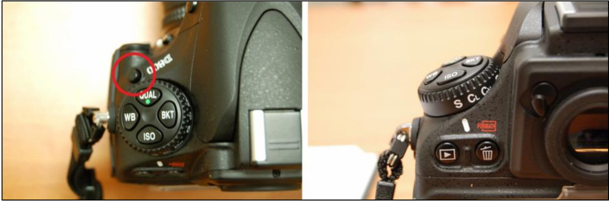
Figure 1. Nikon D800/D810: Setting the shutter-release mode.

Desired setting = S (single shot). To adjust, press the button near the left control knob (below left), and rotate the outer-ring of the control knob until “S” is selected (below right).