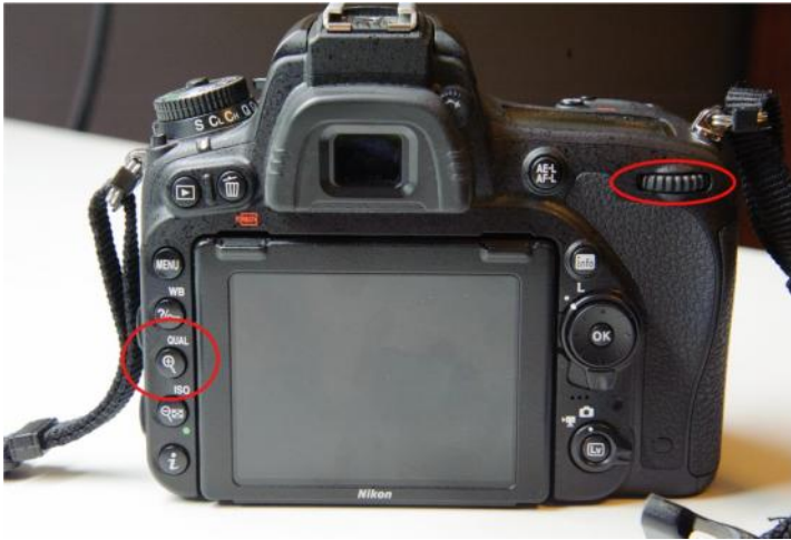
Figure 21. Nikon D750: Configuring image quality settings.

Desired setting = RAW. To set the image quality to RAW, press and hold the QUAL button (circled below), and rotate the primary wheel (circled upper right on camera) until RAW is displayed on the rear LCD.