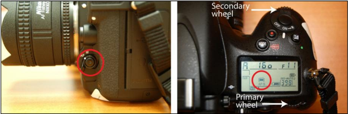
Figure 16. Nikon D800/D810: Configuring focus mode to auto-focus for downward-facing photos.