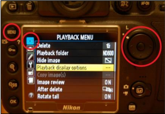
Figure 5. Nikon D800/D810: Playback Menu display options.