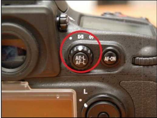
Figure 4. Nikon D800/D810: Setting the metering mode.

Desired setting = Matrix Metering. To adjust, rotate the outer ring of the “AE-L/AF-L” button to the center position (see below).