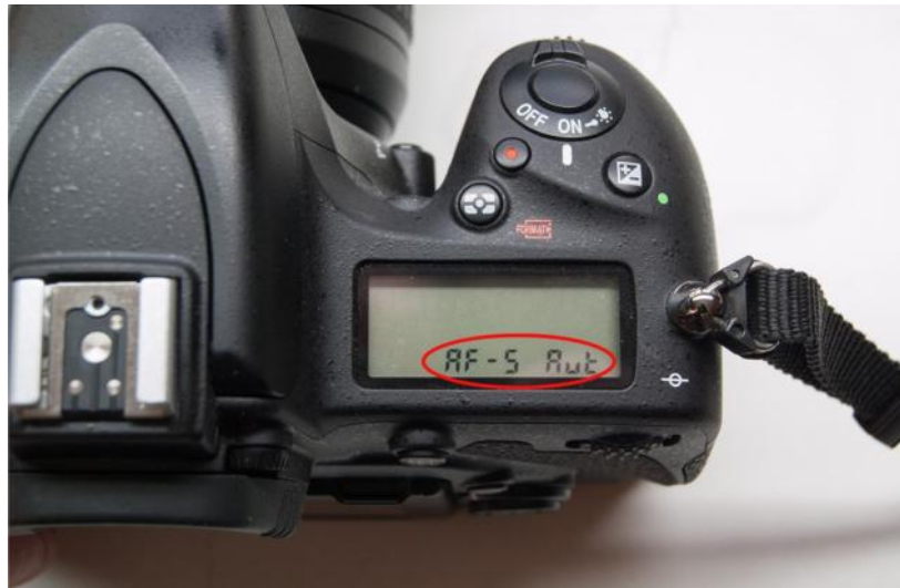
Figure 25. Nikon D750: Top LCD display when camera is configured for single-servo auto-focus auto-mode, where the camera software automatically determines which of the 51 available focus points are used to focus the lens on the subject.