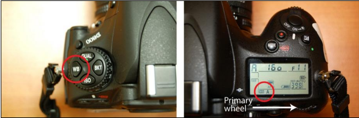
Figure 3. Nikon D800/D810: Adjusting white balance settings.

Desired setting = Auto. To adjust, press the “WB” button on the left control knob (below left), and rotate the primary wheel until “WB A” is displayed in the top LCD (below right).