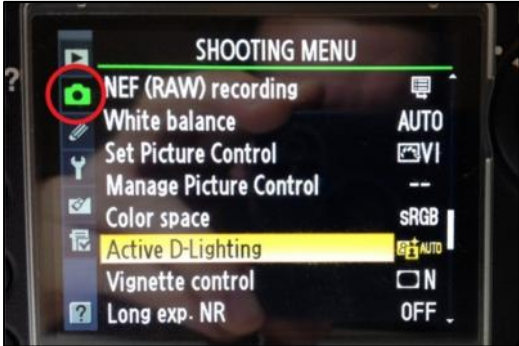
Figure 10. Nikon D800/D810: Shooting Menu Active D-lighting options.

Desired setting = AUTO. To adjust, press “Menu”, and select “Shooting Menu → Active D-Lighting”. Select “Auto” and press the “OK” button.