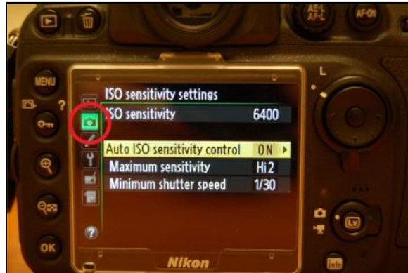
Figure 12. Nikon D800/D810: Shooting Menu ISO sensitivity settings menu.

Desired setting: Minimum shutter speed = 1/30; Maximum sensitivity = Hi2. To adjust, use the “Multi-Selector” and press the “OK” button on the desired settings.