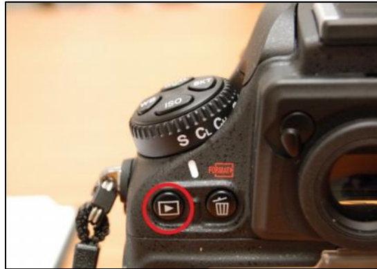
Figure 6. Nikon D800/D810: Location of the “Play” button.