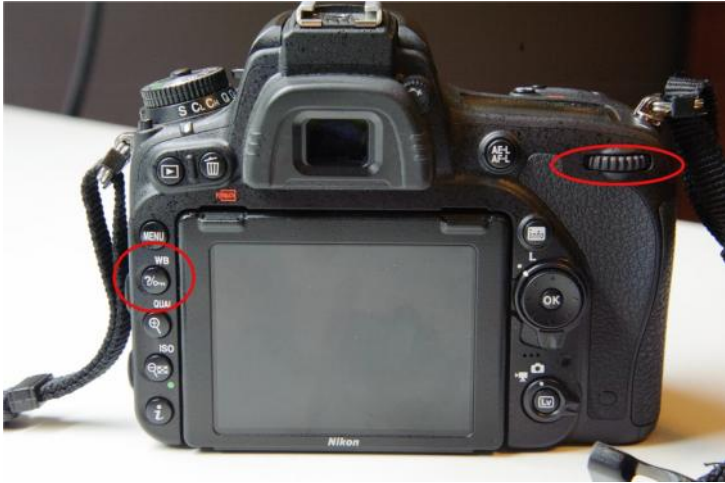
Figure 22. Nikon D750: Configuring white balance settings.

Desired setting = AUTO. To adjust, press and hold the “WB” button on the back of camera (below), and rotate the primary wheel until the AUTO setting is displayed on the large LCD.