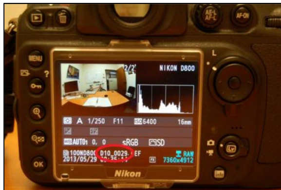
Figure 7. Nikon D800/D810: Locating the file name in the “overview” histogram view during file playback.