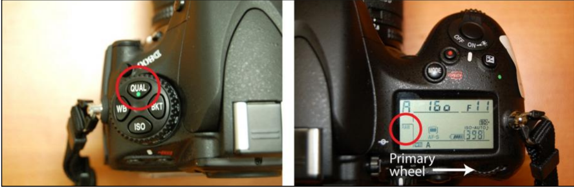
Figure 2. Nikon D800/D810: Setting image quality to RAW.

Desired setting = RAW. To adjust, press the “QUAL” button on the left control knob (below left), and rotate the primary wheel until “RAW” is displayed in the top LCD (below right).