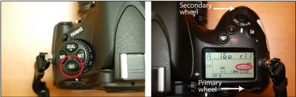
Figure 18. Nikon D800/D810: Configuring ISO settings for downward- and upward-facing photos.