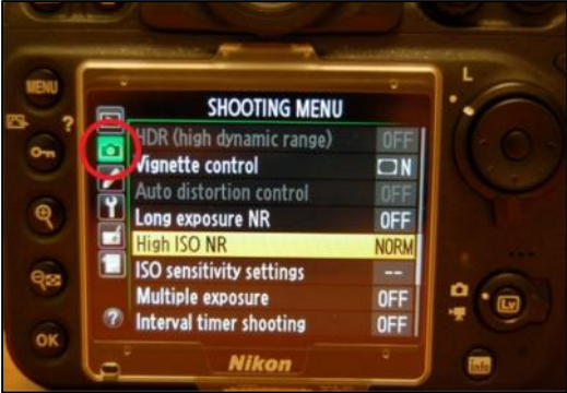
Figure 11. Nikon D800/D810: Shooting Menu high ISO noise reduction options.

Desired setting = Normal. To adjust, press “Menu” and select “Shooting Menu → High ISO NR”. Select “Normal” and press the “OK” button.