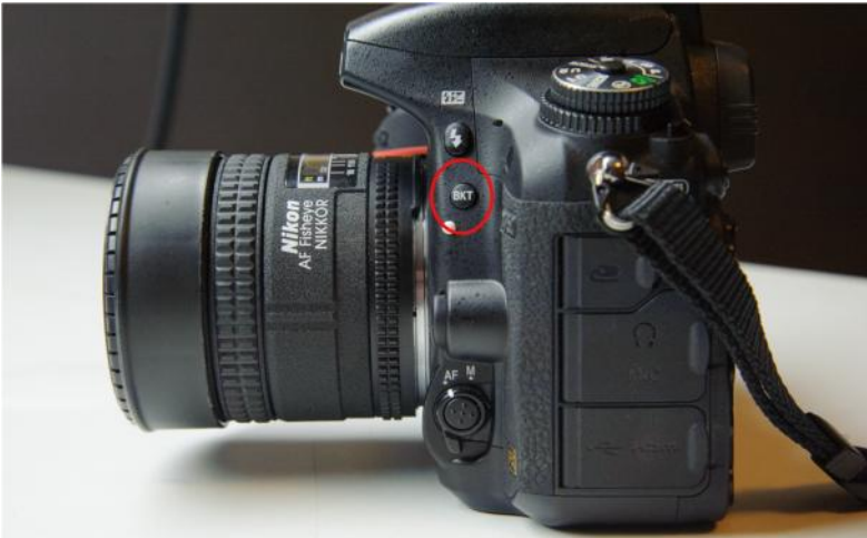
Figure 23. Nikon D750: Toggling bracketing on and off.

Desired setting = OFF. To adjust, press and hold the ‘BKT’ button (circled below). The rear LCD will show “OF” toward the top-center. Rotate the primary wheel until ‘number of shots’ = 0; the letters ‘BKT’ should be absent from the top LCD.