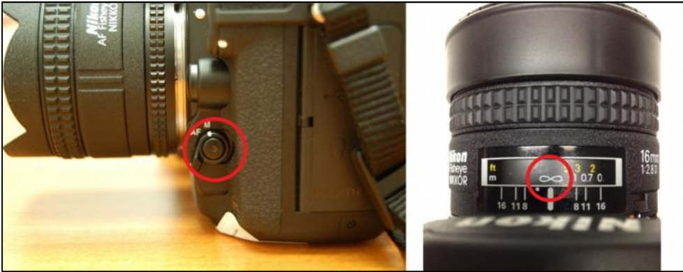
Figure 26. Nikon D750: Focus mode switch, with auto-focus selector button in middle of switch.

Desired setting = Manual. To adjust, set the focus switch to “M” (below left), and rotate the focus ring on the lens to “∞” (below right).