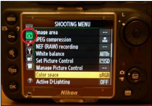
Figure 9. Nikon D800/D810: Shooting Menu color space options.

Desired setting = sRGB. To adjust, press “Menu”, and select “Shooting Menu → Color space”. Select “sRGB” and press the “OK” button.