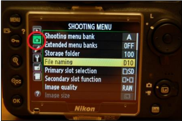
Figure 8. Nikon D800/D810: Shooting Menu file naming options.

Desired setting = DXX, where XX = the unique NEON Domain number. To adjust, press the “Menu” button, and select “Shooting Menu → File naming”. Enter the appropriate alpha-numeric characters. When finished, “DSC” should no longer be displayed, and your custom characters should be.