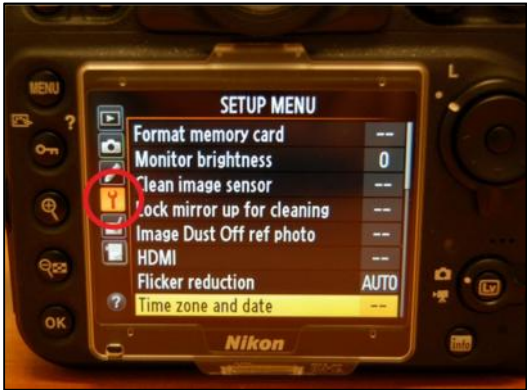
Figure 13. Nikon D800/D810: Setup Menu options for timezone and date.