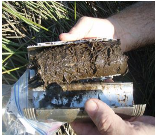
Figure 2. Example of a typical wetland soil core demonstrating a poorly defined boundary between O and M horizons. Note that gloves should be worn by NEON technicians when handling soil samples.