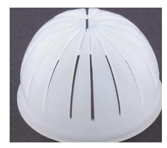
Figure 1 Example soil core catcher that comes with the AMS Multi-Stage Sampler

Note: If using a coring device that comes with a plastic 'soil core catcher' ( Figure 1 ), but local soils are fairly well consolidated, try to extract a core first without using the catcher, installing it only if needed.