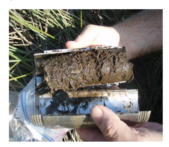
Figure 2 . Example of a typical wetland soil core demonstrating a poorly defined boundary between O and M horizons. Note that gloves should be worn by NEON technicians when handling soil samples.

a. If both O and M horizons are present and there is an obvious boundary between them, separate the horizons using a clean, sterilized soil knife. Retain either only the O horizon (for microbe-only bouts) or both the O and M horizons (for bouts that include n-transformations and/or biogeochemistry). If keeping both, process as separate samples.