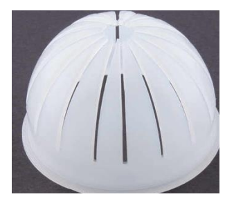
Figure 1 Example soil core catcher that comes with the AMS Multi-Stage Sampler

Note: If using a coring device that comes with a plastic 'soil core catcher' ( Figure 1 ), but local soils are fairly well consolidated, try to extract a core first without using the catcher, installing it only if needed.