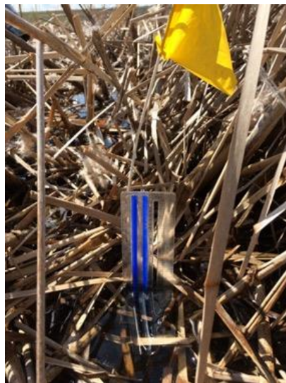
Figure 5. Measuring standing water depth at a flooded sample location