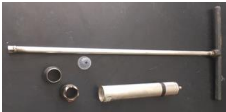
Figure 1. Components of the Multi-stage Sludge Sampler

Regarding the former, a specialized coring device – such as the AMS Multi-Stage Sludge Sampler ( Figure 1 ), need only be purchased if the domain’s standard tool does not allow for collection of high-quality soil cores in the local wetland conditions. This is likely to be the case for mineral soils where the substrate is very unconsolidated and significant amounts of material fall out the bottom when attempting to core. For thick, organic wetland soils, coring devices may have trouble cutting through fibrous organic layers without causing significant compaction. In this case, cutting soil monoliths may be a better alternative. When both organic and mineral horizons are present, a combination of the two techniques may work best. Table 2 provides suggested equipment for different wetland types and conditions – if unsure of the most appropriate device or sampling strategy to use in their domain, Field Operations should contact Science to discuss.