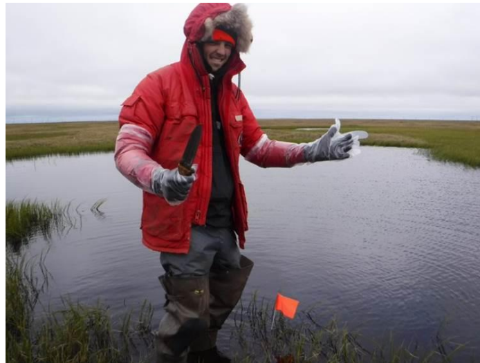
Figure 6. Technician preparing to collect an O horizon monolith in Alaska, using shoulder-length gloves and a hori hori.