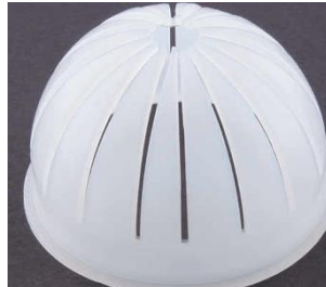
Figure 4. Example soil core catcher that comes with the AMS Multi-Stage Sampler