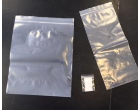
Figure 2. Different size bags to use for N-transformation incubations. Small bag is for the sample ID.