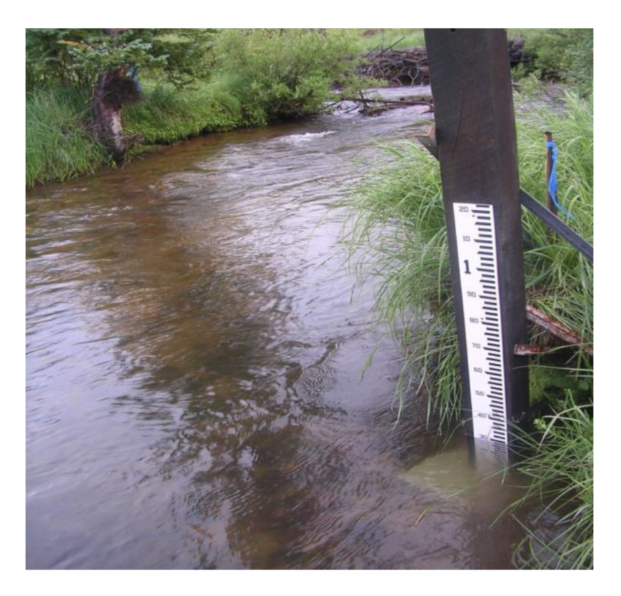
Figure 1: Example of staff gauge installed in a pool