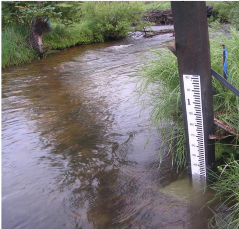
Figure 1: Example of staff gauge installed in a pool