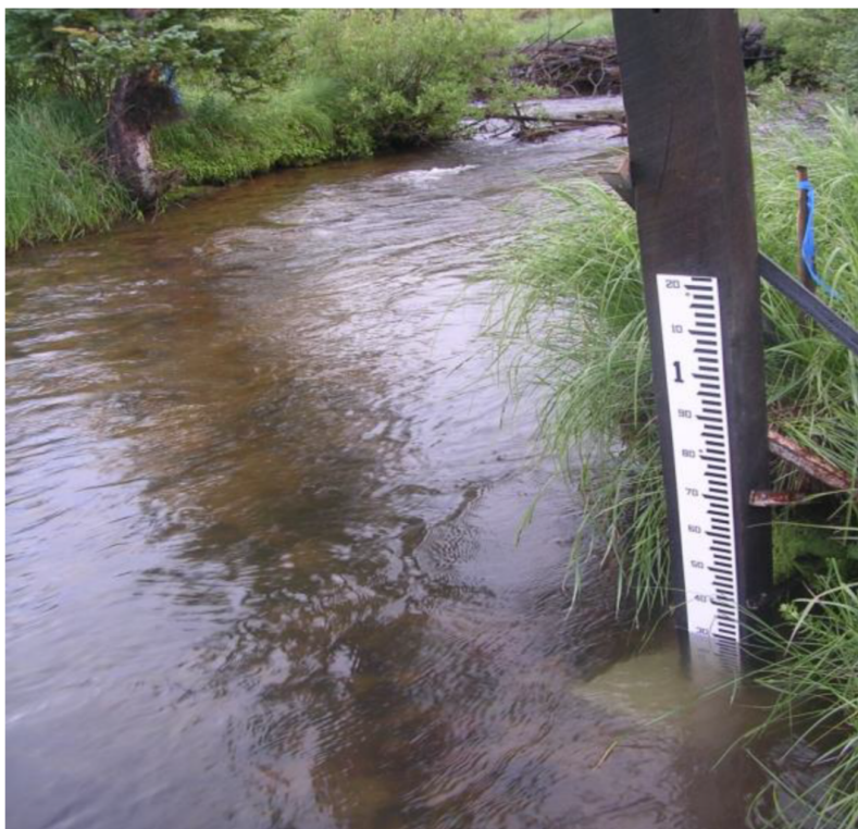
Figure 1: Example of staff gauge installed in a pool